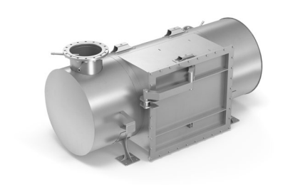
SCR & oxidation catalyst Box (Ø1.0 m): This configuration without a silencer is ideal for retrofitting and for limited space

Find your local support online: jenbacher.com/en/services/field-service For more information, visit INNIO Group's website at innio.com